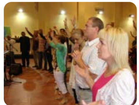
Receiving the Holy Spirit