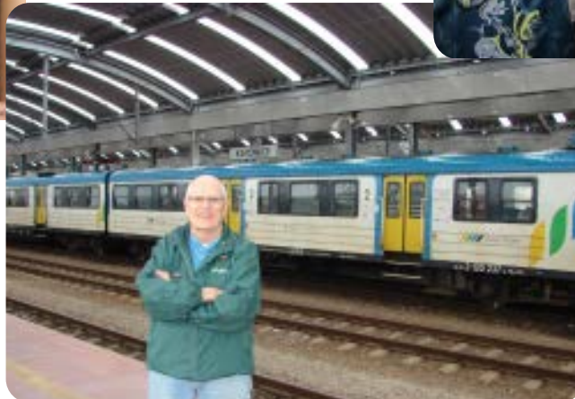
Katowice Train Station