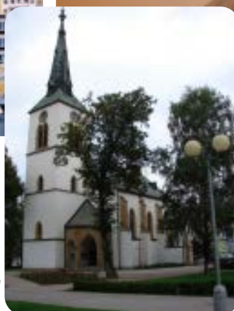
Dolny Kubin Church