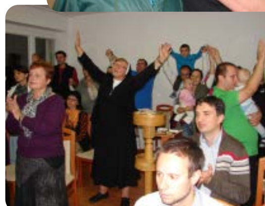
Worship at Mass

The real thing happened now, in Slovakia, 35 years later! ...continued