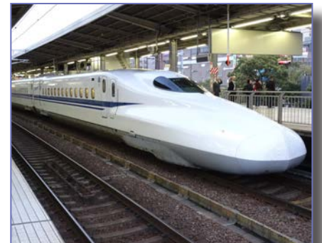
Shinkansen - 287 kph

We stayed at the Global Mission Center in Iwaki and drove a short distance to Tomioka on the coast. This ghost-town had been destroyed and was just opened to the public in February, but gates and guards still protect people from no-go zones with higher than normal radiation levels. The nuclear reactor that remains functional is being shut down, but that will take 30 years. You don't just throw a switch and turn it off. A conventional power plant has been built to replace the one that melted down. Temporary housing has also been built but folks are still too afraid to return and start over.