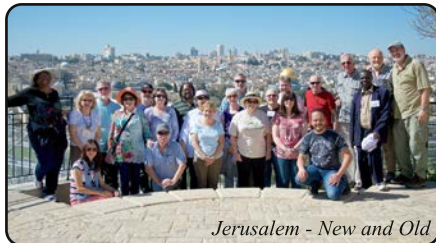
Jerusalem - New and Old

To think that Almighty God, whom 'the heaven of heavens cannot contain' (1 Kgs 8:27) - reduced Himself to the size of a man that could be laid in that tiny grave, was suddenly overwhelming. Incomprehensible!