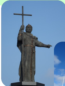
Russ Founder of Russia