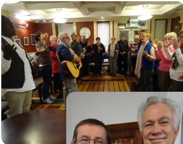
Macroon Prayer Group