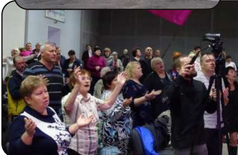
Church of Praise